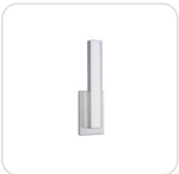
WS14-040-BN Brushed Nickel