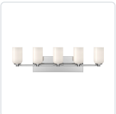
VL57732-CH/GO Chrome/Glossy Opal Glass