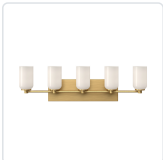
VL57732-BG/GO Brushed Gold/Glossy Opal Glass