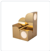
TL82412-PB Polished Brass