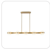
LP38148-BG Brushed Gold