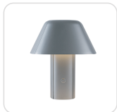
TL21509-SPC Space Gray