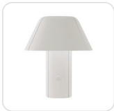
TL21509-PW Pearl White