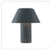
TL21509-BVL Black Vegan leather