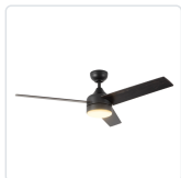
CF0716452MB-LKW Matte Black