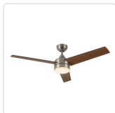
CF0716452BN-LKW Brushed Nickel