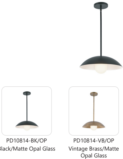
PD10814-BK/OP Black/Matte Opal Glass