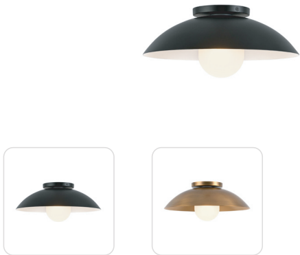
SF10814-BK/OP Black/Matte Opal Glass SF10814-VB/OP Vintage Brass/Matte Opal Glass