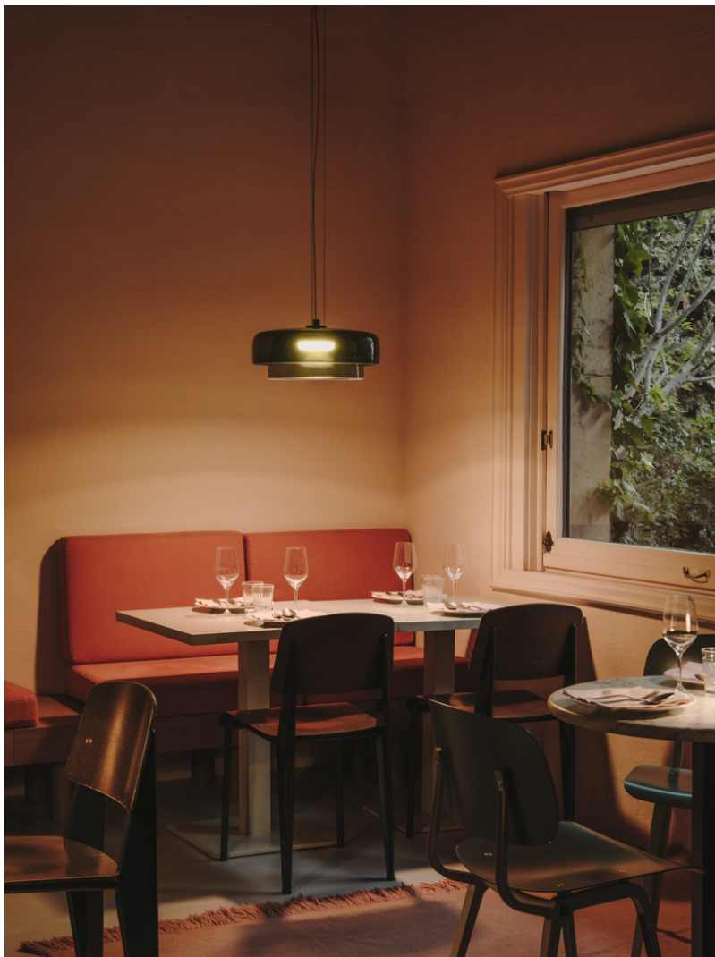
Image may not match reference. LedsC4 reserves the right to amend any of the product's components. The data related to flux, power and colour temperature may be subject to changes made by the manufacturer.