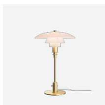
PH 3/2 Pale Rose Table Lamp