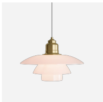
PH 3½-3 Pale Rose Brass Pendant