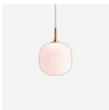
VL45 Radiohus Pale Rose Pendant