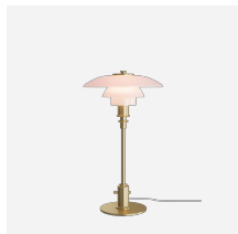
PH 2/1 Pale Rose Brass Table Lamp