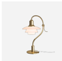
PH 2/2 Question Mark Pale Rose Table Lamp