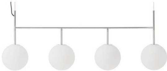
POLISHED STEEL, MATTE OPAL BULB 1465139