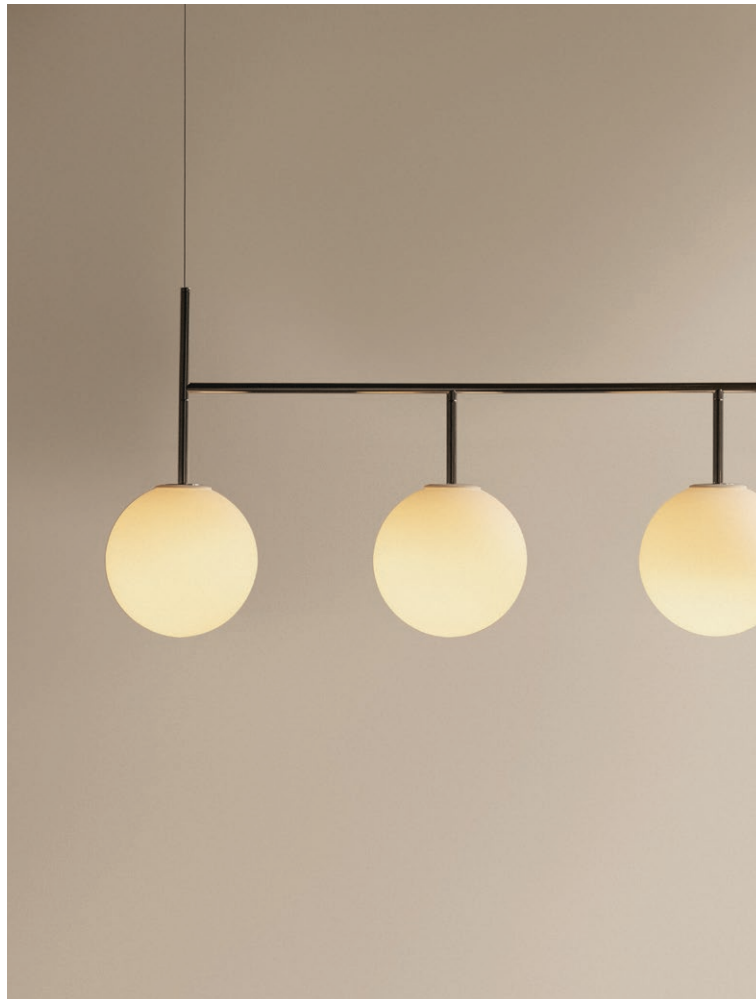
TR BULB SUSPENSION FRAME Designed by Tim Eundle