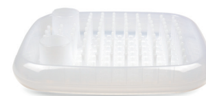
Dish-rack / Clear 2080 TL Caps / Clear