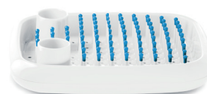
Dish-rack / White 1690 C Caps / Blue