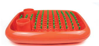
Dish-rack / Orange 1090 C Caps / Green