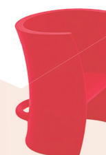
Red 1004 C

The Finnish designer Eero Aarnio (born in 1932 in Helsinki) is one of the greatest innovators of modern furniture design. His work as a designer began in the early 60s, when he opened his own design studio in Helsinki. Eero Aarnio began experimenting with plastics, vivid colors and organic forms, breaking away from traditional design conventions. Many of Aarnio's now iconic works are included in the world's most prestigious museums.