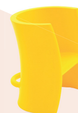
Yellow 1665 C