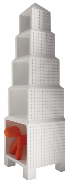
Matt colour White 1736 C