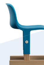
Frame / Natural ash 7018 Seat / Light blue 1256 C