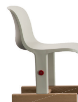
Frame / Natural ash 7018 Seat / White 1735 C