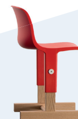
Frame / Natural ash 7018 Seat / Orange 1086 C