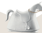
White 1735 C

Marc Newson has been described as the most influential designer of his generation. He has worked across a wide range of disciplines, creating everything from furniture and household objects to bicycles and cars, yachts, various architectural commissions, and signature sculptural pieces for clients across the globe. His clients include a broad range of the best known and most prestigious brands in the world . Many of his designs have been a runaway success for his clients, and have achieved the status of modern design icons. Marc Newson was included in Time magazine's 100 Most Influential People in the World, and has received numerous awards and distinctions.