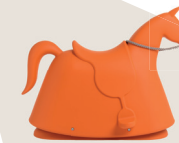
Orange 1001 C