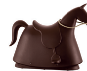
Brown 1069 C