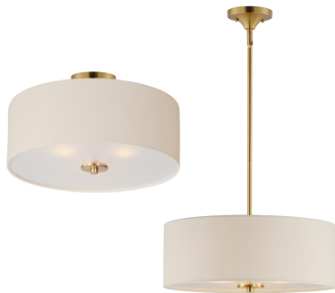
Convertible to Pendant