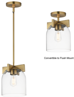
Convertible to Flush Mount