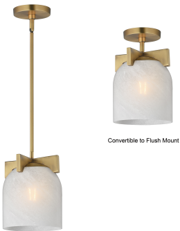
Convertible to Flush Mount