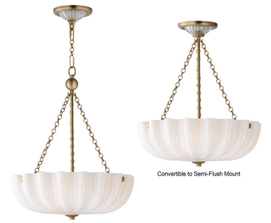
Convertible to Semi-Flush Mount