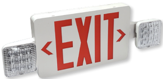
NEX-712-LED/R Red Letters / White Housing