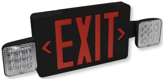
NEX-712-LED/RB Red Letters / Black Housing