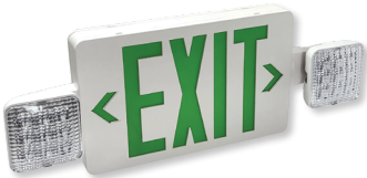
NEX-712-LED/G Green Letters / White Housing