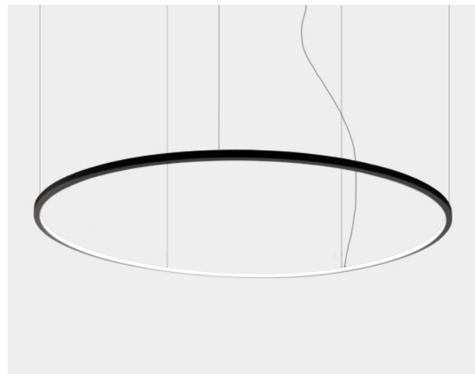
Technical drawing Size ref. image mm - inch