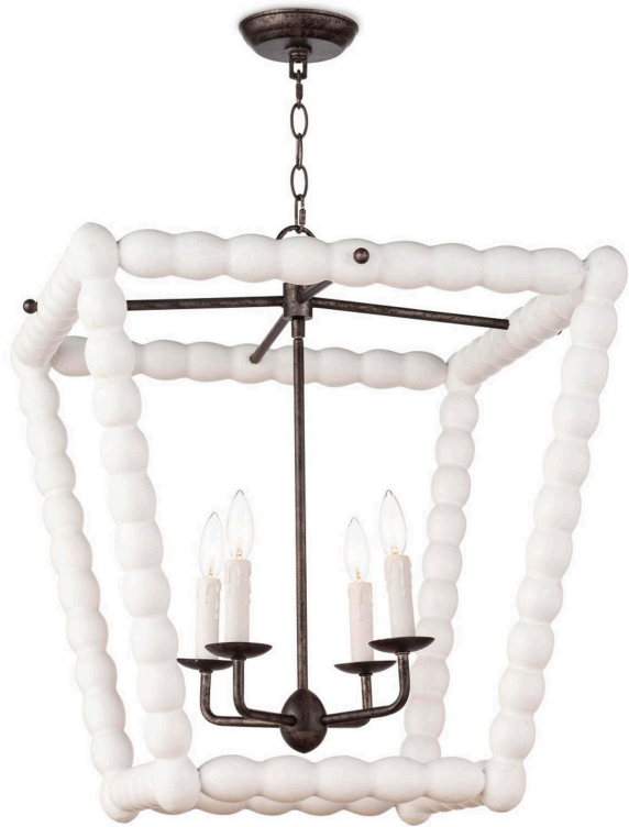
Perennial Lantern (White) 16-1254WT