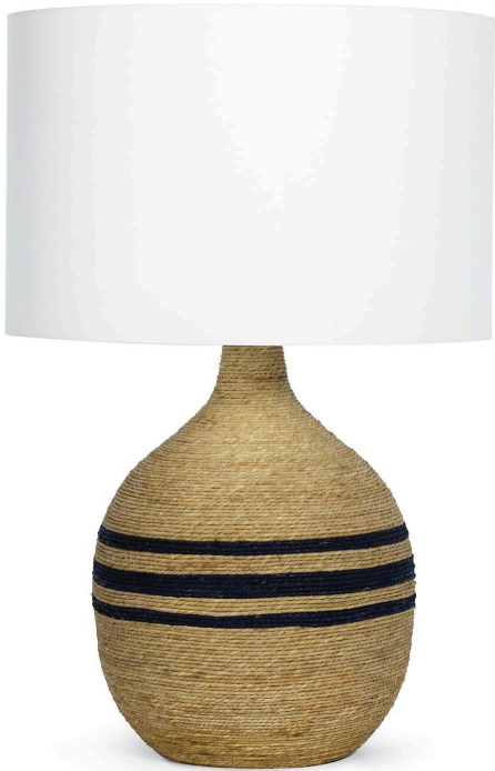
Maren Table Lamp 13-1640NAV