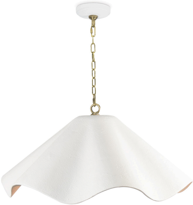
Marisol Pendant Large 16-1514