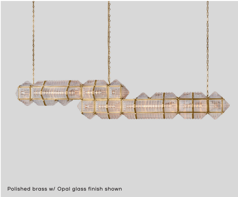
Polished brass w/ Opal glass finish shown