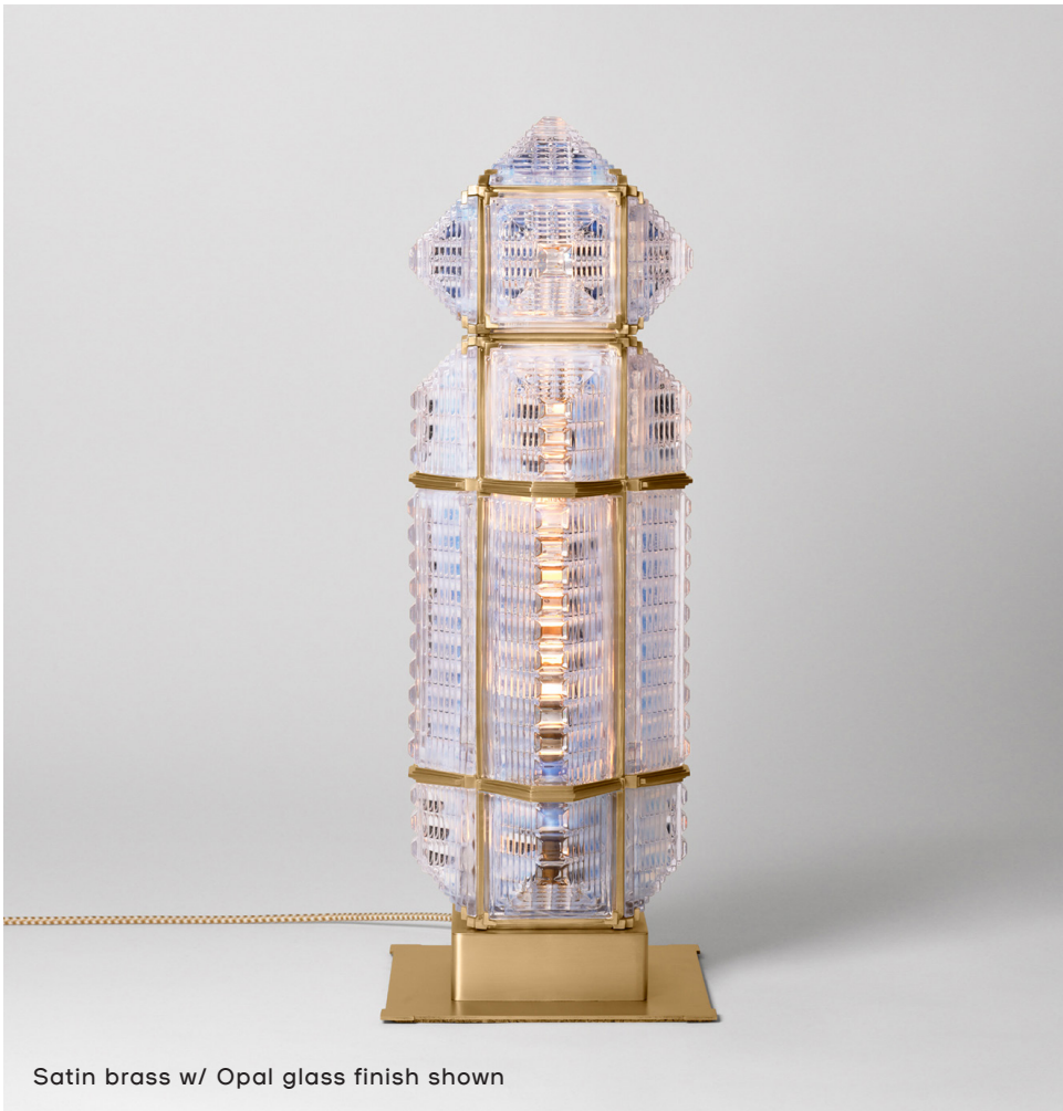
Satin brass w/ Opal glass finish shown