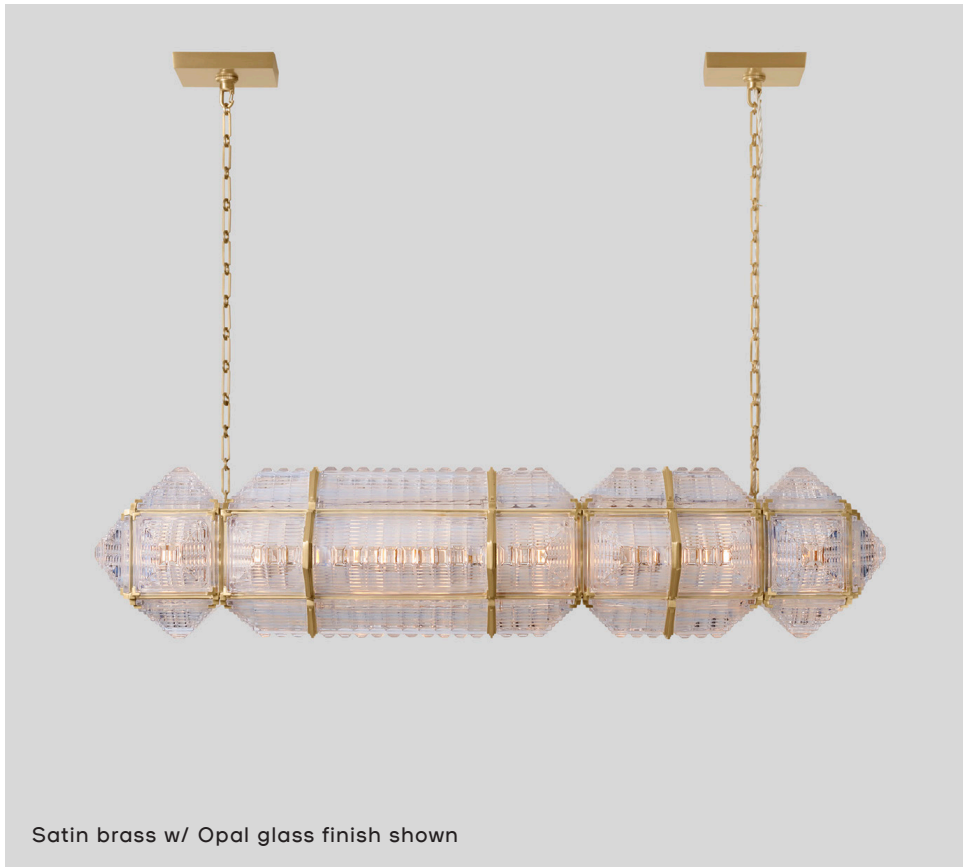
Satin brass w/ Opal glass finish shown