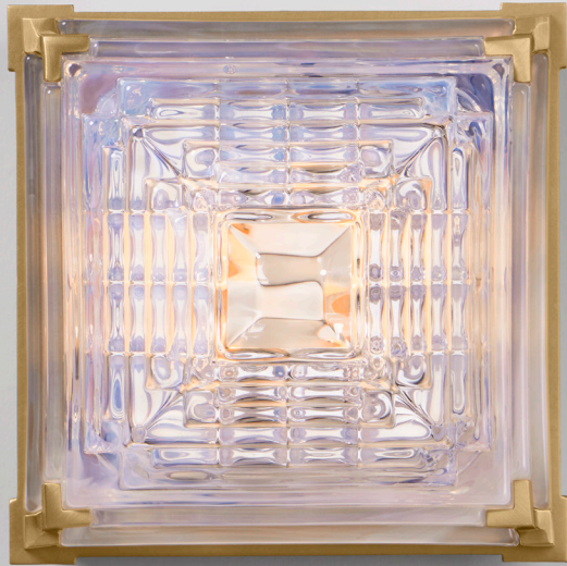
Satin brass w/ Opal glass finish shown