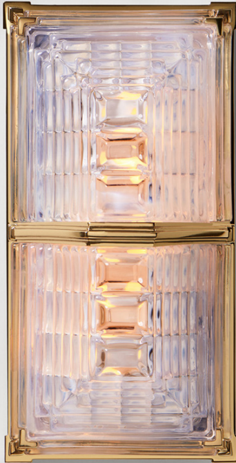
Polished brass w/ Opal glass finish shown