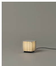
Shiro 17 Interior