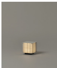
Shiro 17 Batería