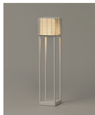
Shiro 17 Alta