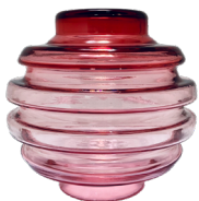
Gold Ruby EL

Color available in limited quantities; contact Silica Studio for availability.