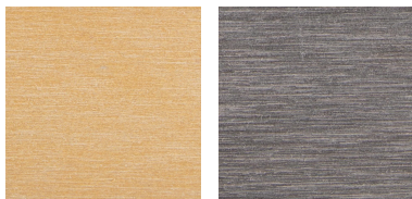
Natural N-Dura Wood