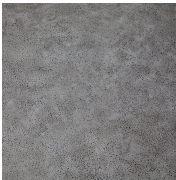
Aged Stone Gray