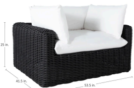
* Frame dimensions only