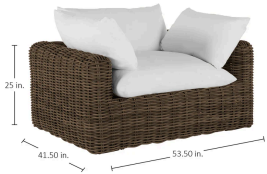
* Frame dimensions only