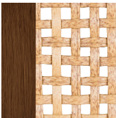
Light Raffia/Natural Sandalwood