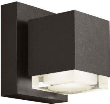
Bronze Downlight Only