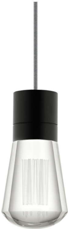
Black Finish Black & White Cord

Includes 9 watt, 241 delivered lumen, 3000K, 2200K or Warm Color Dimming 3000K-2200K LED module. Dimmable with most LED compatible ELV or Triac dimmers. Fixture provided with 12 feet of field-cuttable cloth cord. Must specify cord color when ordering.