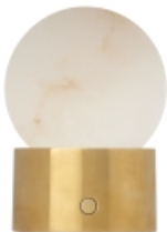
Alabaster and Hand Rubbed Antique Brass