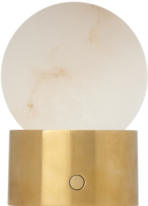
Alabaster and Hand Rubbed Antique Brass

Includes 120-240V 2.2 watts, 234 delivered lumens, 90 CRI 2700K LED module. Built-in three way dimming. Hand Rubbed Antique Brass includes cream cable. 6 feet of USB C to C cable. Wall charger included.