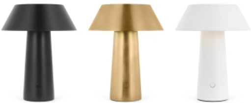
Black Hand Rubbed Antique Brass Matte White

Includes 120-240V 2.2 watts, 200 delivered lumens, 90 CRI 2700K LED module. Built-in three way dimming. Black includes black cable. White includes white cable. Natural Brass includes cream cable. 6 feet of USB C to C cable. Wall charger included.