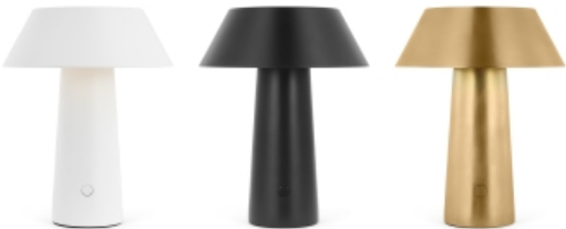
Matte White Black Hand Rubbed Antique Brass