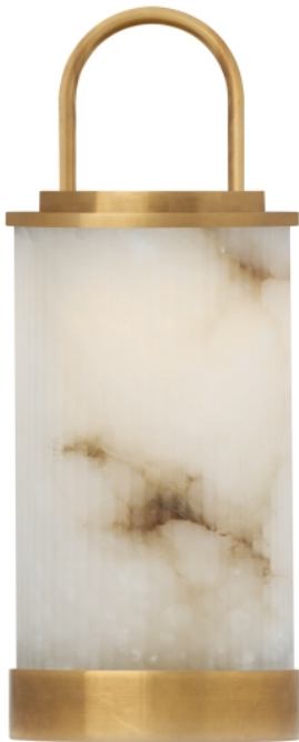
Alabaster and Hand Rubbed Antique Brass

Includes 120-240V 2.2 watts, 137 delivered lumens, 90 CRI 2700K LED module. Built-in three way dimming. Hand Rubbed Antique Brass includes cream cable. 6 feet of USB C to C cable. Wall charger included.