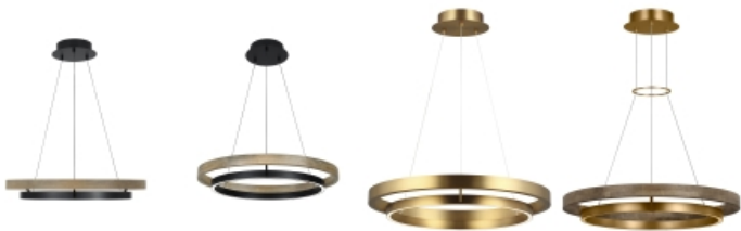
Matte Black / Weathered Oak Wood