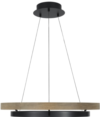
Matte Black / Weathered Oak Wood

Includes 120 volt, 50.7 watt, 3685 total delivered lumens, 3000K LED module. 3500K only available in weathered oak. Dimmable with most LED compatible ELV and TRIAC dimmers. Ships with 12 feet of field-cuttable cable.