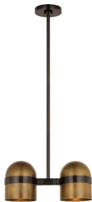
Blackened Bronze / Bright Worn Brass

Includes 8.7 watt, 350 total delivered lumens, 90 CRI 2700K LED modules. Dimmable with most LED compatible ELV, TRIAC and 0-10V dimmers. Ships with 4-12" and 2-6" rigid stems. 120V-277V. Sloped ceiling compatible 22.5°.