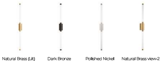
Natural Brass (Lit)

To view all available finish options, please visit techlighting.com