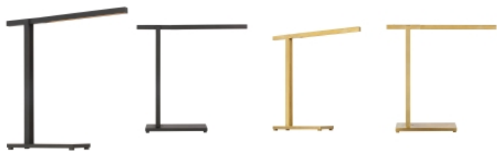
Nightshade Black Three-Quarter View Nightshade Black Side View Natural Brass Three-Quarter View Natural Brass Side View