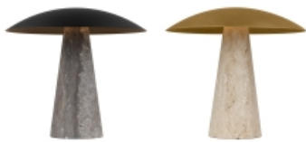
Bronze/Dark Travertine Natural Brass/Natural Travertine