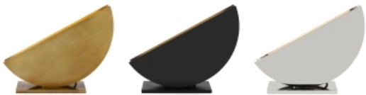
Natural Brass Nightshade Black Polished Nickel