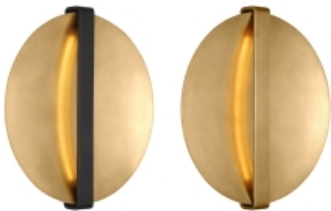
Dark Bronze/Natural Brass Natural Brass/Natural Brass/