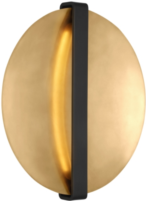
Dark Bronze/Natural Brass

Includes 11.4 watt, 236 delivered lumens, 2700K LED module. Dimmable with most LED compatible ELV, TRIAC and 0-10V dimmers. Can be mounted vertically or horizontally. 120V-277V.