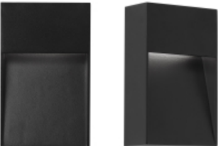
Black Black (Alt)