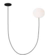
Matte Black with Etched White Glass