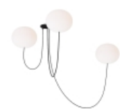
Matte Black with Etched White Glass