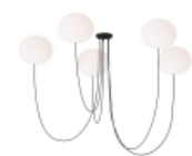
Matte Black with Etched White Glass