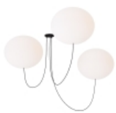
Matte Black with Etched White Glass